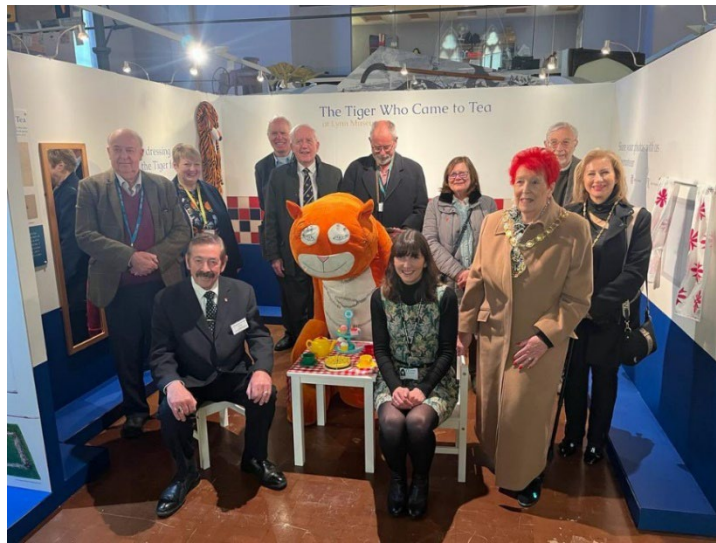
Opening event on 24 November 2023

celebrates the life and work of Judith Kerr, one of Britain's best known children's book author-illustrators.