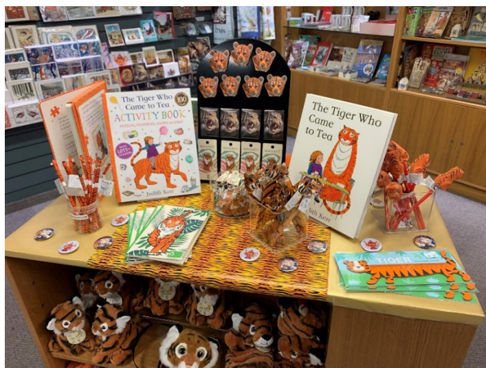
Retail display of tiger-related merchandise at Lynn Museum

Copies of Kerr's original artwork will be on display alongside notes and sketches. Children can also enjoy stepping into Sophie's kitchen to have tea with a life-size tiger. Published in 1968, Kerr's first picture book The Tiger Who Came to Tea began life as a bedtime story for her own children. It became a classic. By the 40 th anniversary in 2008, the book had 11 language translations and had sold over five million copies.